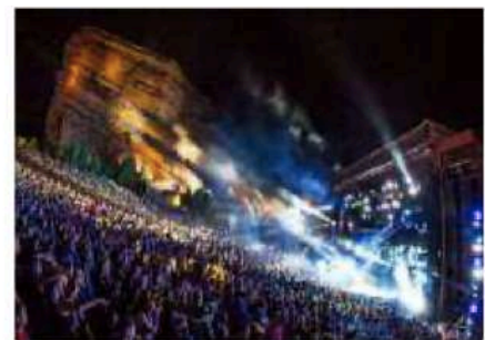
Revolution at Red Rocks Red Rocks Amphitheatre