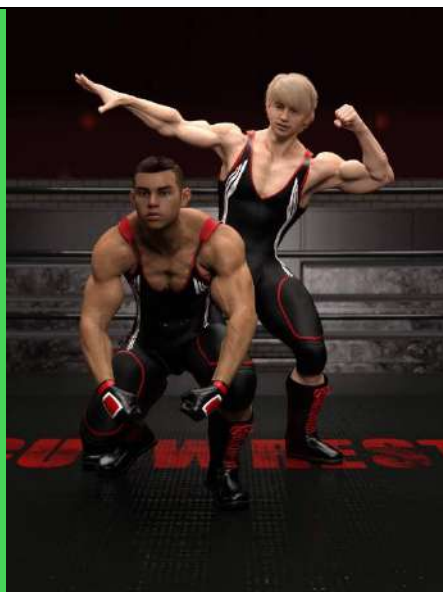
Triple Crown Tag Team Champions: Gangster of Love & The Space Cowboy