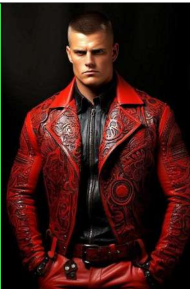
Rich 'Corinthian' Leather TRIPLE CROWN CHAMPION